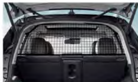
Cargo Barrier Cargo Barrier protects vehicle occupants from any loose items during sudden braking. Maximum load mass of 60kg.