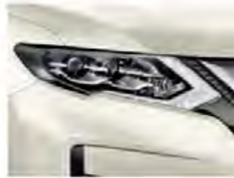
White - 3P - QAB