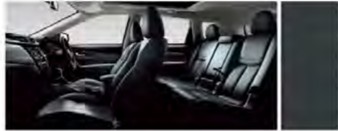
GENUINE LEATHER WITH PERFORATION - BLACK