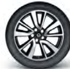
19" Alloy Wheel