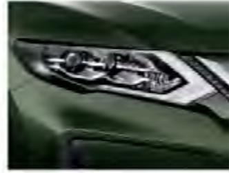
Military Green - PM - EAN