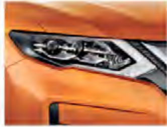
Orange - PM - EBB