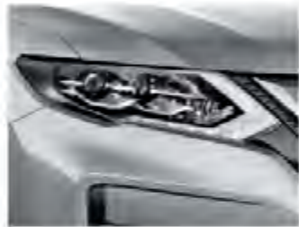
Silver - M - K23