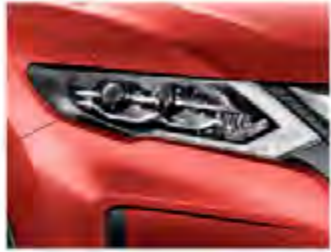
Tinted Red - CP - NBF