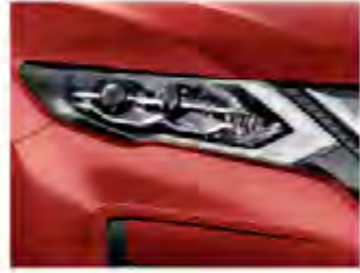
Red - S - AX6