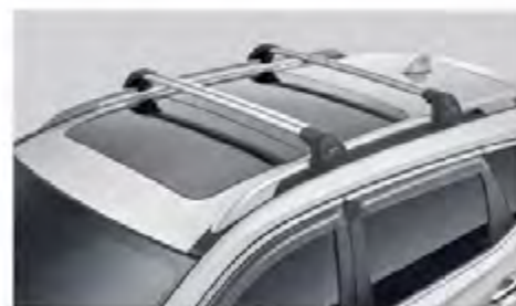
Thule Car Rack Systems - Wingbar Low-profile, complete rack system with exceptional aerodynamic performance and integrated design with maximum carrying capacity of 75kg.