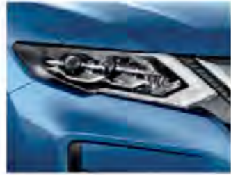
Blue - PM - RAW