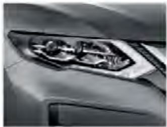
Gray - M - KAD