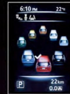
MATCH THE DISPLAY TO YOUR COLOUR