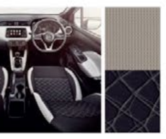
CLOTH MODERN BLACK / GREY