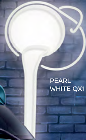
PEARL WHITE QX1 (M)