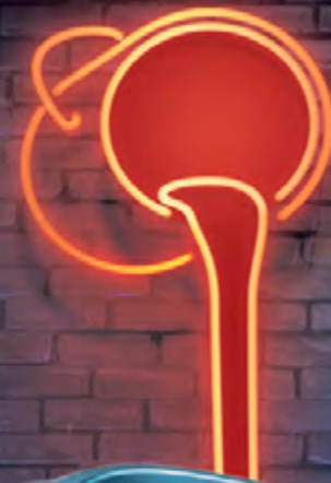
CLARET RED AY4 (M)