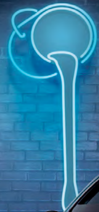
TURQUOISE BLUE RBK (M)