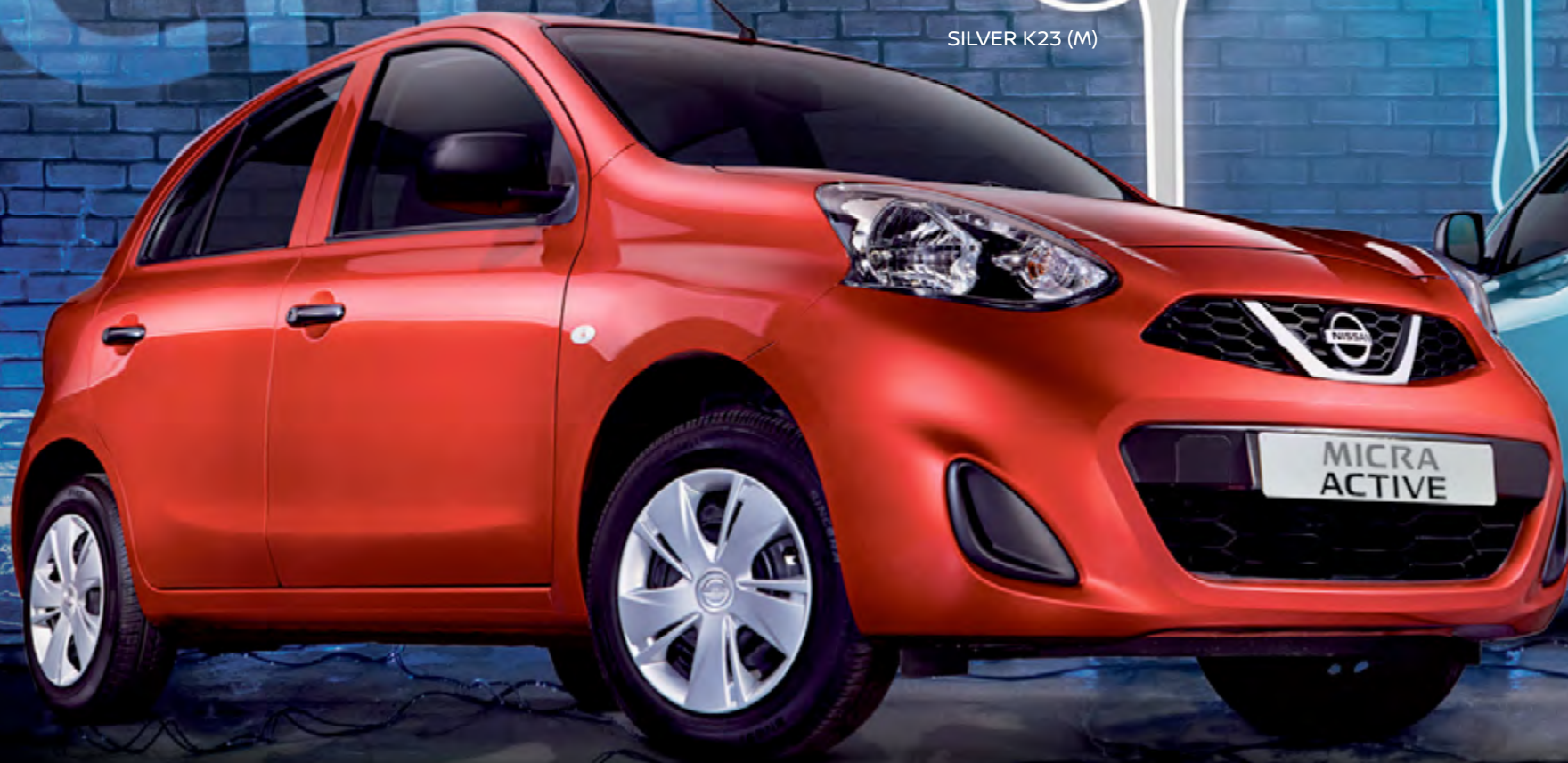
SILVER K23 (M)