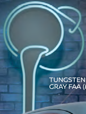
TUNGSTEN GRAY FAA (M)